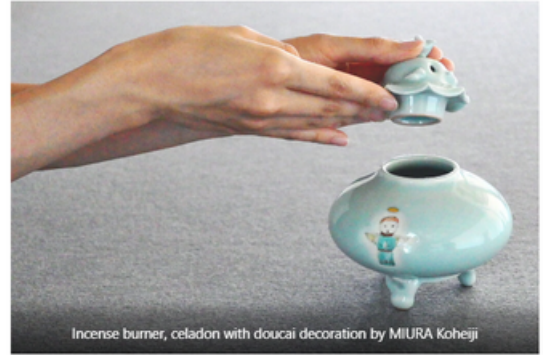
Incense burner, celadon with doucai decoration by MIURA Koheiji